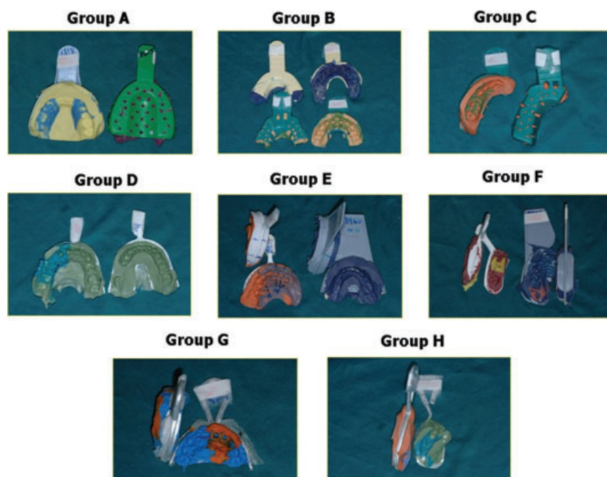
Figure 2 Examples of tray type.

29 anterior impressions, 12 recorded the single abutment, and 31% were poor quality. All impressions registered the canine. Of 35 posterior impressions, one did not register the canine, and 31.4% were poor quality.