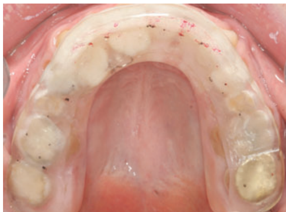
Figure 5 Adjusted occlusal splint with idealized occlusal scheme marked (occlusal view).

On an articulated maxillary cast (Waterpik Technologies, Inc., Pittsburgh, PA; British Gypsum Ltd., Nottingham, UK), two z-springs were formed in 0.5-mm diameter stainless steel wire (K. C. Smith & Co., Potters Bar, Herts, UK) and waxed onto the palatal surfaces of the upper right central incisor and canine teeth. The splint was then waxed in baseplate wax (Tenatex, Kemdent, Swindon, Wiltshire, UK) to achieve the theoretically ideal occlusal scheme at the proposed recorded vertical dimension. The wax extended 3 mm onto palatal soft tissues and about 1 mm over the buccal and labial cusps. The occlusal aspect was modified carefully by functional waxing to create a flat occlusal wax surface to produce even point contacts with all the opposing teeth. A shallow, smooth wax pattern was built up in the anterior region to provide immediate disclusion of the posterior teeth on lateral and protrusive excursions. A shelf was extended posteriorly to the incisal tip contacts by about 1.5 mm to allow for possible subsequent mandibular repositioning. The cast was invested in a flask using a capping technique and the wax was boiled out, packed, and processed with a heat-cured clear acrylic resin (Lucitone 199, Dentsply International Inc.). Following deflasking, the cast was reattached to its split mount-