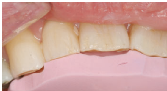
Figure 7 Final tooth position of number 11 and 13, (anterior-palatal view) labial to their pre-orthodontic movement as shown by a silicone putty index.

ing, and the occlusal surface was checked, devested for final finishing, and ready for fit (Fig 4).