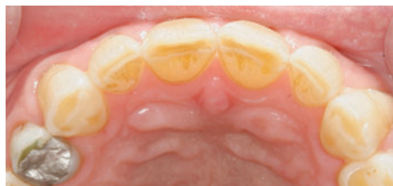
Figure 8 Maxillary (occlusal view) of anterior teeth showing orthodontically corrected position of number 11 and 13.

Proximal enamel stripping was carried out with abrasive strips (3M EPSE, St Paul, MN) adjacent to the incisor and canine, and the z-springs were activated with orthodontic Adams pliers. The maxillary splint was fitted and checked for its retention and correct occlusal objective (Figs 5 and 6). The splint was adjusted labially and around the incisor and canine teeth to allow for unhindered orthodontic movement. The patient was instructed to wear the appliance during the night, preferably all day as well, and reviewed on a weekly basis for occlusal readjustment and every two weeks to reactivate z-springs by pulling them downward and forwards in the direction of desired tooth movement.