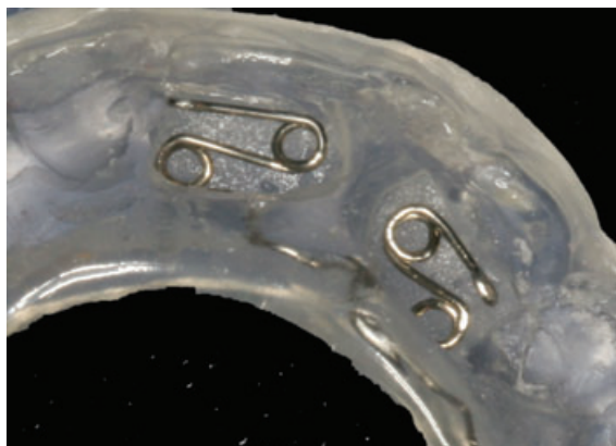
Figure 4 Fitting surface of occlusal splint with attached z-springs prior to activation.

On an articulated maxillary cast (Waterpik Technologies, Inc., Pittsburgh, PA; British Gypsum Ltd., Nottingham, UK), two z-springs were formed in 0.5-mm diameter stainless steel wire (K. C. Smith & Co., Potters Bar, Herts, UK) and waxed onto the palatal surfaces of the upper right central incisor and canine teeth. The splint was then waxed in baseplate wax (Tenatex, Kemdent, Swindon, Wiltshire, UK) to achieve the theoretically ideal occlusal scheme at the proposed recorded vertical dimension. The wax extended 3 mm onto palatal soft tissues and about 1 mm over the buccal and labial cusps. The occlusal aspect was modified carefully by functional waxing to create a flat occlusal wax surface to produce even point contacts with all the opposing teeth. A shallow, smooth wax pattern was built up in the anterior region to provide immediate disclusion of the posterior teeth on lateral and protrusive excursions. A shelf was extended posteriorly to the incisal tip contacts by about 1.5 mm to allow for possible subsequent mandibular repositioning. The cast was invested in a flask using a capping technique and the wax was boiled out, packed, and processed with a heat-cured clear acrylic resin (Lucitone 199, Dentsply International Inc.). Following deflasking, the cast was reattached to its split mount-