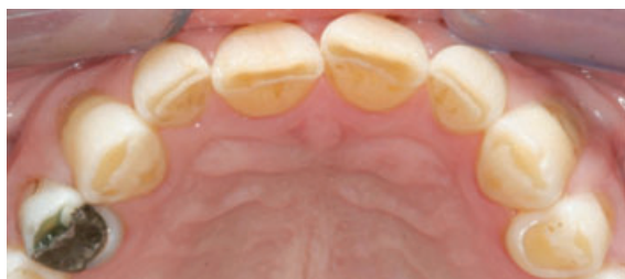
Figure 2 Maxillary (occlusal view) anterior teeth showing palatally positioned number 11.

On clinical examination, the patient was classified as Class IV according to the Prosthodontic Diagnostic Index (PDI). 8 The maxillary arch was noted to be fairly well aligned with a slightly palatally positioned upper right central incisor and signs of severe generalized tooth surface loss with loss of occlusal stability and shape (Figs 1 and 2). Analysis of the occlusion on the articulator following retruded mounting of diagnostic casts, showed the retruded contact on the upper and lower right first molars with minimal vertical and horizontal slide to the