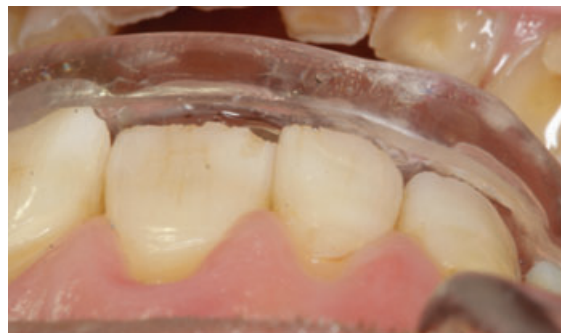
Figure 6 Lateral view of splint showing unrestricted space for number 11 and 13, to move.