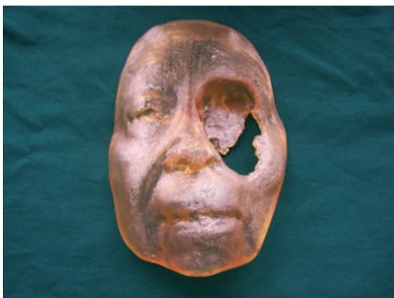
Figure 6 Clear model made with the SLA 7000 and UV light-activated epoxy resin.

would not be used in the fabrication of the prosthesis, some of the undercut areas were desirable for retention. The patient was seated in an upright position with her obturator in place. She was oriented to face between the two camera tripods ensuring that the margins of the defect were visible in the computer windows and the image was captured. Another image was made orienting the patient to capture the undercut, just inferior to the superior orbital rim, and another set of images was made to capture the lateral walls of the medial aspects of the defect. The images were reconstructed and imported into the 3dMD patient software. The composite data were stored in a format to fabricate a rapid prototype model (Figs 2-4).