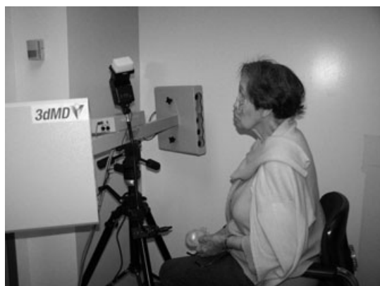
Figure 2 Patient seated at 3dMDface™.

Geometrically, the cameras form a continuous point cloud from two stereo camera viewpoints, and the information acquired is used to produce a wire diagram used in the manufacture of 3D models. 9 To date, there is no literature demonstrating the use of the 3dMDface™ System to fabricate a 3D model for a facial prosthesis (Fig 1).