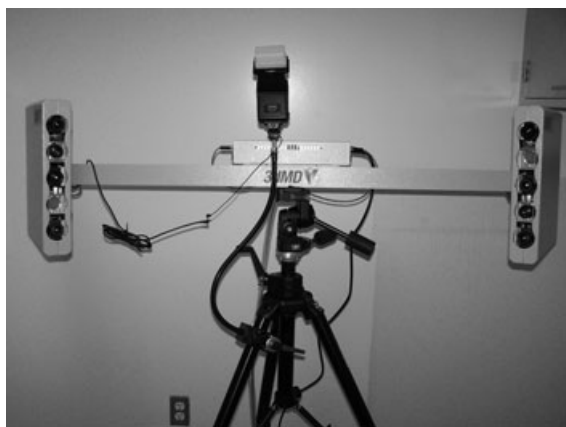
Figure 1 – 3dMDface™ System.