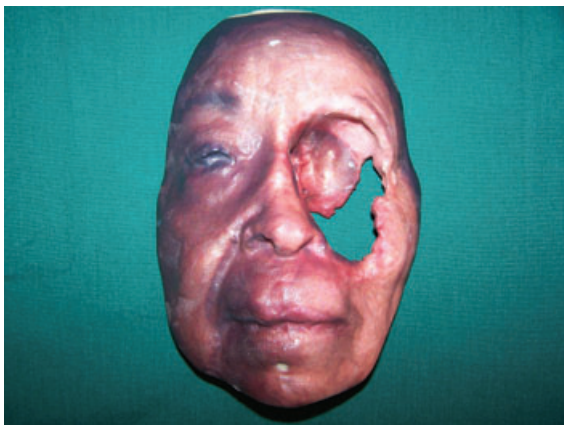
Figure 5 Color model made with the ZPrinter ® 450 and high performance composite material.