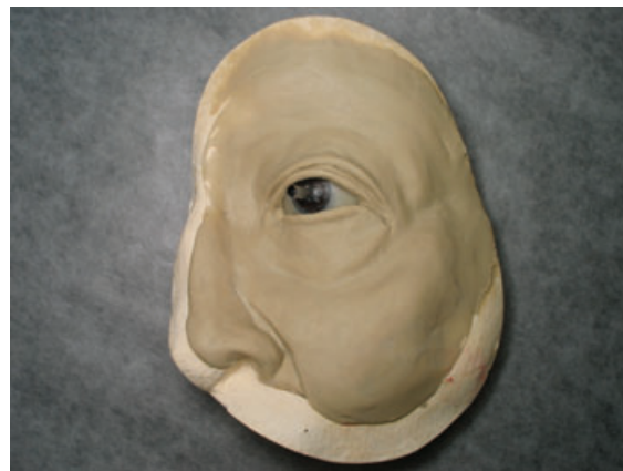
Figure 7 Clay sculpture on model.