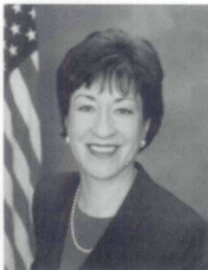
Senator Susan Collins

In 2002, the Health Care Safety Net Amendments included provisions authored by Senators Collins and Feingold in the Dental Health Improvement Act. This initiative is intended to improve access to oral health care by strengthening the dental workforce in our nation's rural and underserved communities. The legislation authorizes $50 million through FY 2006 for grants to states to help them develop innovative dental workforce development programs