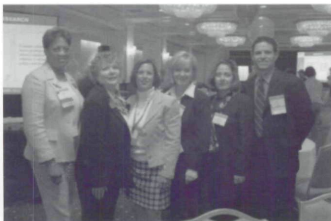
ADHA, Celebration Co-sponsors