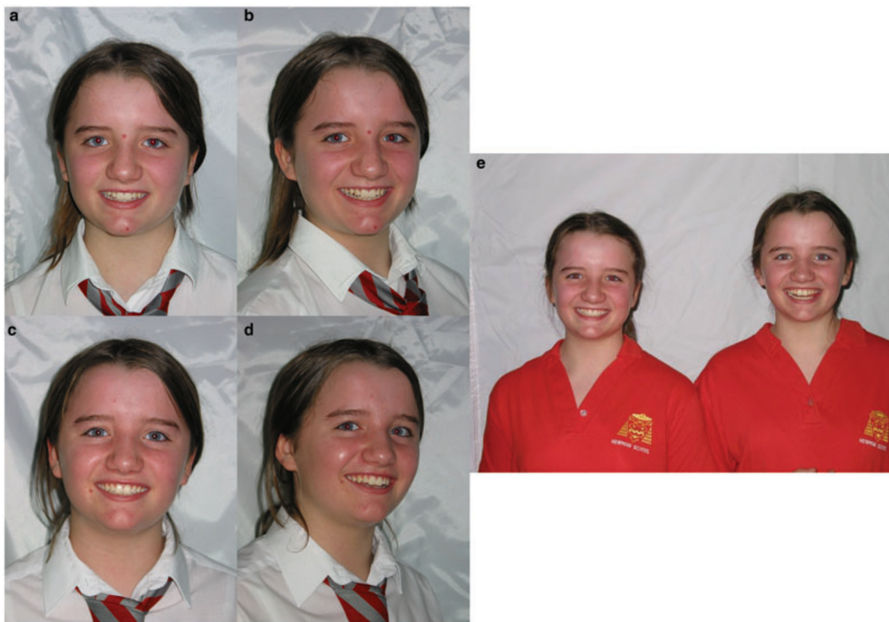
Fig. 1. (a, b) RaJ front 3/4 views, (c, d) ReJ front and 3/4 views, (e) the twins together at T1.

The laser scanning system used in this study consisted of two high-resolution Minolta Vivid VI900™ 3D cameras operating as a stereo pair (Fig. 2). Each camera has a manufacturer's accuracy of 0.3 mm and emits an eye safe Class I (FDA) laser ( \lambda = 690 nm at 30 mW) at an object to scanner distance of 600–2500 mm, employing a fast mode scan time of 0.3 s. The system uses a one-half-frame transfer charged couple device (CCD) and can acquire 307 000 data points. For soft tissue surface registration, a Minolta medium range lens with focal length of 14.5 mm was used and subjects were positioned at a distance of 1350 mm from the cameras. Information was transferred to a reverse modelling software package, Rapidform 2004 (INUS Technology Incorporated, Seoul, Korea), for analysis. This software provides nine different workbenches, which together allow high quality polygon, meshes, accurate free-form non-uniform rationale B-spline (NURBS) surfaces, and geometrically perfect solid