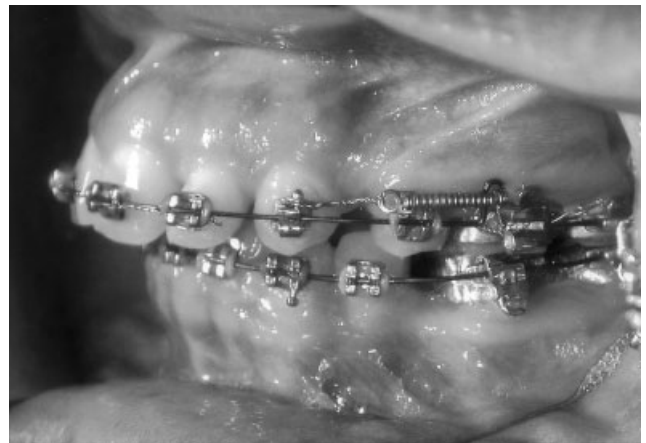
Fig. 1. The full edgewise arch set-up.

The inclusion criteria were: 1) the maxillary first premolars had been extracted on both sides at least 3 months before starting to move canines distally after complete aligning and levelling. This period was allowed for bone fill-in of the extraction sockets before the study period (13,14); 2) left and right canines, second premo-