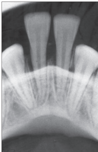
Figure 2. Radiograph showing luxation of permanent lower central incisors.

A case is presented of a 13-year-old boy with chronic ITP who sustained labial luxation of both permanent lower central incisors—with partial alveolar fracture resulting in displacement of the labial alveolar plate—as a result of a fall (Figures 1, 2). He presented to the emergency room 2 hours later, complaining of oral bleeding, and was seen by a dentist. Bleeding was controlled by pressure with damp gauze. The patient was admitted to a hospital, under the care of the consultant pediatric hematologist, where his condition could be monitored. Emer-