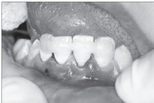
Figure 3. Permanent lower central incisors repositioned and splinted with composite resin.

The patient was reviewed every 3 months, as it was considered likely that the repositioned teeth would become nonvital. Eventually, loss of vitality of both permanent lower central incisors was confirmed, by negative response to thermal and electrical vitality tests and