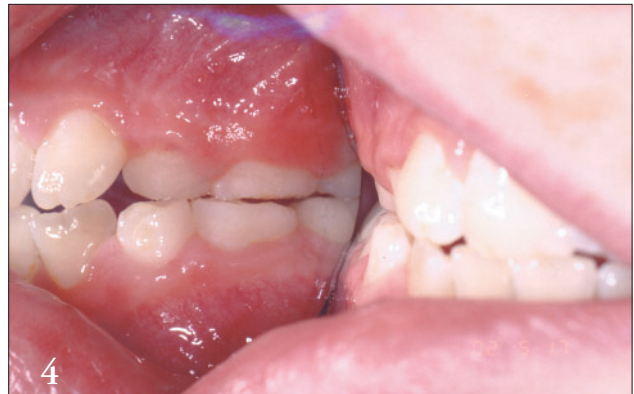
Figures 1-4. Patient taking amphetamine with moderate gingival enlargement.

a different philosophy and strategy to deliver his/her message to these patients. Examples of these strategies are to: