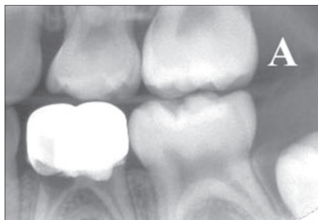
Figure 1A. Left bite-wing radiograph of a 5-year, 2-month-old girl. Primary mandibular first molar with internal resorption in the mesial root 7 months after performance of pulpotomy with formocresol.