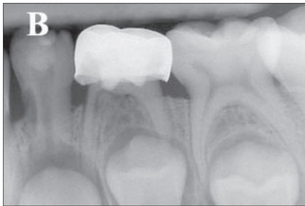
Figure 2B. Ten months later. Notice the calcified tissue replacing the pulp tissue in the resorption area. Similarly to Figure 1, internal resorption did not involve the surrounding tissues and was, therefore, not considered a failure.

MTA prevents microleakage, is biocompatible, and promotes regeneration of the original tissues when it is placed in contact with the dental pulp or periradicular tissues. 28