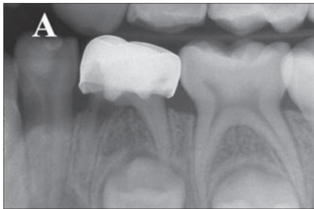
Figure 2A. Left bite-wing radiograph of an 8-year, 2-month-old girl. Primary mandibular first molar with internal resorption in the mesial root 38 months after performance of pulpotomy with MTA.