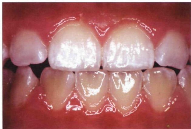
Figure 1b. Two-week photograph of anterior teeth treated with the polyethylene strip-delivery system. Note the difference between the maxillary teeth that received whitening treatment compared with the mandibular teeth that did not receive whitening treatment.