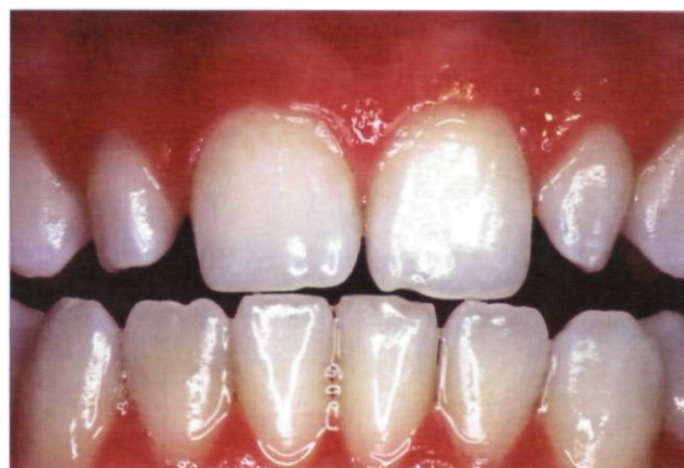
Figure 2c. Photograph of anterior teeth treated with the tray-delivery system, when whitening treatment was completed 2 weeks for both arches.