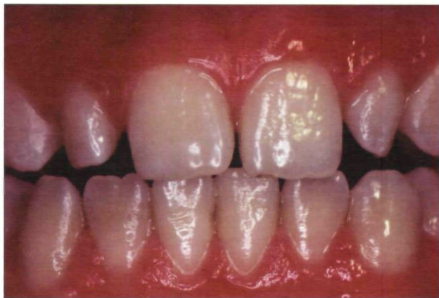
Figure 2a. Baseline photograph of anterior teeth to be treated with the tray-delivery system.

Both treatment regimens were generally well tolerated. Minor tooth sensitivity and oral irritation (predominantly gingival irritation) were the most common complaints, reported by 27% of the subjects assigned to the strip group and 42% of the subjects assigned to the tray group. All events resolved during or after completion of the study. Subjects were not given any products to help them manage dental sensitivity. They were, however, instructed to contact the authors by telephone if they experienced sensitivity other than mild or if they altered this study's