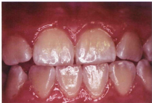
Figure 1a. Baseline photograph of anterior teeth to be treated with the polyethylene strip-delivery system.

Subjects in the 10% carbamide peroxide gel group were asked to dispense approximately half of the gel in a syringe into the custom-fabricated, plastic delivery tray provided. The tray was filled and placed in the mouth after toothbrushing each night, and worn overnight while sleeping. Subjects assigned to the 10% hydrogen peroxide polyethylene strip group were asked to place 1 strip over the maxillary anterior teeth for 30 minutes twice daily, once in the morning and once in the evening. A standard dentifrice was given to each subject for use throughout the study (Crest Cavity Protection, The Procter and Gamble Company, Cincinnati, Ohio).