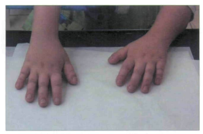
Figure 1. The broad thumbs in a 12-year-old female with Rubinstein-Taybi Syndrome.