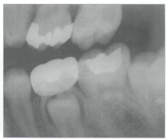
Figure 7. A bitewing of the left side showing the previously performed restorations.