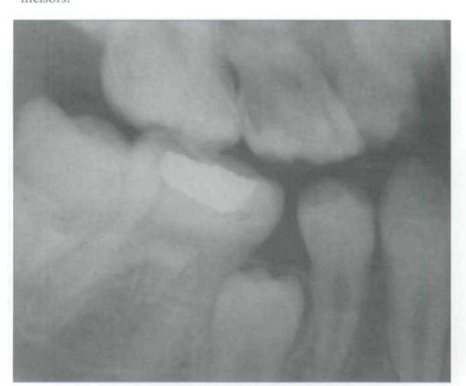
Figure 6. A bitewing of the right side showing the previously performed restorations, the loss of space for the mandibular second premolar and distal caries on the maxillary primary second molar.

In this case report, the authors hypothesized that, because of the radical and dramatic mode of dental treatment under general anesthesia, the foster parents would try harder to maintain the patient's oral hygiene to avoid future dental disease and subsequent treatment, as reported in previous studies. <sup>20,21</sup> The girl's difficult behavior, however,