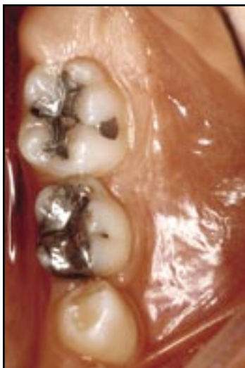
Figure 1. Case 1: Clinical appearance of cystic lesion showing a large swelling in the region of the primary mandibular second molar.

It showed clear limits and caused displacement of the latter (Figure 2). Cytopathologic examination of an aspiration biopsy showed compatibility with a cystic lesion, and the differential diagnosis suggested a dentigerous cyst.