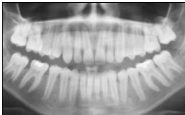
Figure 4. Case 1: Radiographic view 13 months postoperatively showing normal features and eruption of mandibular second premolar.

Radiographic examination showed a well-defined, unilocular, radiolucent area surrounding the crown of the bud of the permanent mandibular right lateral incisor, associated with root resorption of the primary lateral incisor and canine (Figure 5). Based on the clinical and radiographic aspects, the working diagnosis was a dentigerous cyst.