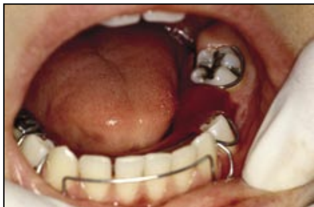
Figure 3. Case 1: Placement of a removable appliance with acrylic extension penetrating into the cystic cavity.