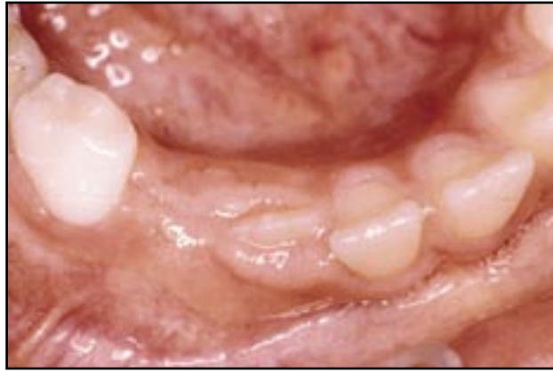
Figures 6 and 7. Case 2: Clinical and radiographic view 7 months postoperatively showing normal features, new bone formation, and eruption of the permanent incisor.