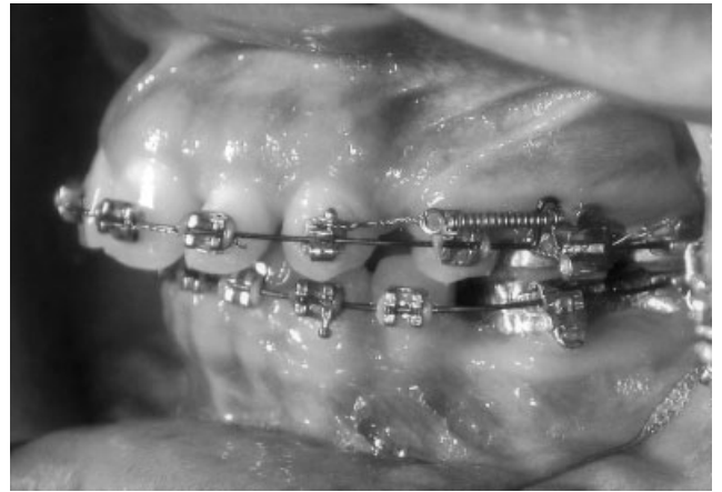
Fig. 1. The full edgewise arch set-up.

The inclusion criteria were: 1) the maxillary first premolars had been extracted on both sides at least 3 months before starting to move canines distally after complete aligning and levelling. This period was allowed for bone fill-in of the extraction sockets before the study period (13,14); 2) left and right canines, second premo-