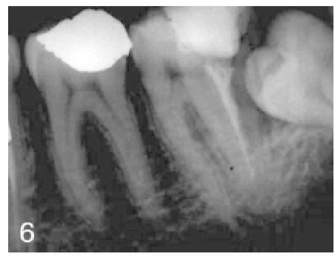
Fig. 6 Radiograph at 9 months post treatment.