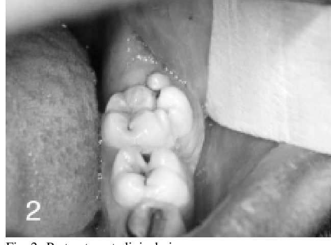
Fig. 2 Pretreatment clinical view.