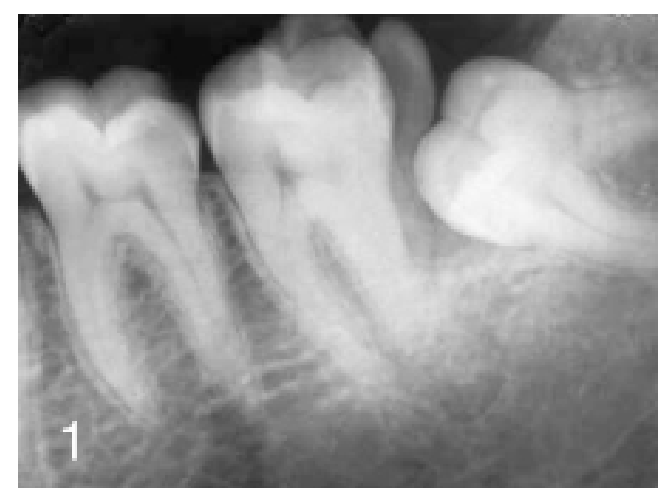
Fig. 1 Pretreatment radiograph.