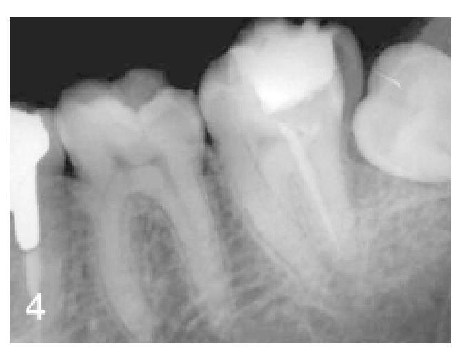
Fig. 4 Post treatment radiograph.