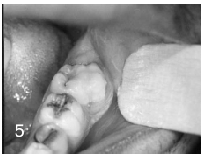
Fig. 5 Post treatment clinical view.