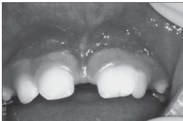
Figure 7. Frontal view of the labial frenum 17 days after laser surgery.