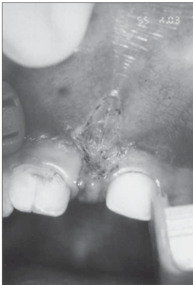
Figure 3. Aspect of the labial frenum after the first part of the procedure.