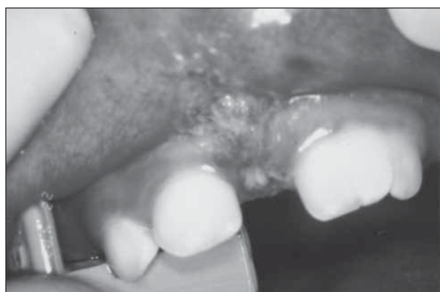
Figure 5. View post-surgery.

In this clinical case, the authors opted for performing a frenectomy on a young child due to periodontal risk, the difficulty of cleaning the maxillary incisors, and speed and ease of the laser procedure compared to conventional surgery. Clinically, a practitioner could observe a double frenum, with fibrous tissue, as shown in Figure 1. Although