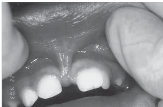
Figure 1. View of the hypertrophic labial frenum.

University of São Paulo (FOUSP), São Paulo, Brazil. The chief complaint related by the mother was the difficulty of cleaning the teeth in the upper incisors region due to the volume of the superior labial frenum (Figure 1).