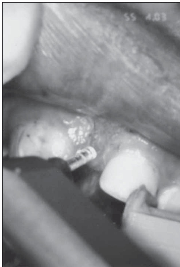
Figure 4. Use of the Er:YAG laser in the removal of the fibers inserted on the alveolar bone.