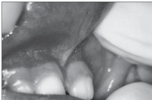
Figure 8. Lateral view of the labial frenum, showing its new insertion, in the limit between inserted gingival and oral mucosa.

fibers remaining on the alveolar border and periosteum tissue up to the limit of the palatal papillae.