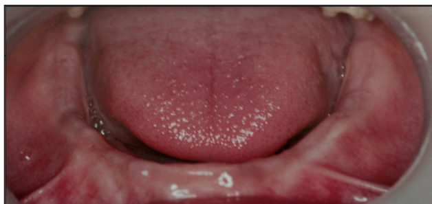
Figure 2. An intraoral photograph showing the Mandibular arch with all Primary Teeth missing.