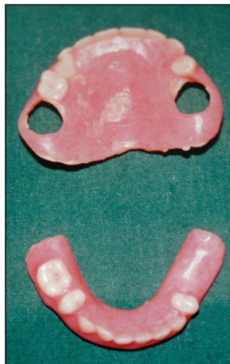
Figure 5. Photograph showing the upper and lower complete dentures with windows created in the region of the maxillary right and left primary second molars.

During the first visit, the child showed the presence of teeth nos. A and J. Consequently, upper and lower complete dentures were fabricated with openings in the region of teeth nos. A and J (Figures 5 and 6). During the second visit, J teeth had exfoliated. The dentures had become loose, so a new set was fabricated with an opening only in the region of tooth no. A.