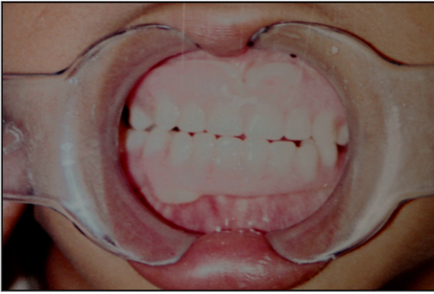
Figure 6. Photograph showing the upper and lower dentures inside the oral cavity.

The parents reported a drastic improvement in the child's speech and mastication. The patient is being kept under periodic observation to initiate future treatment modification if and when the need arises.