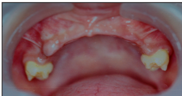
Figure 1. An intraoral photograph showing the maxillary arch with Right and Left Second Primary Molars

the following: presence of A; defective formation of dentin in teeth nos. 3, 14, 19, and 30.