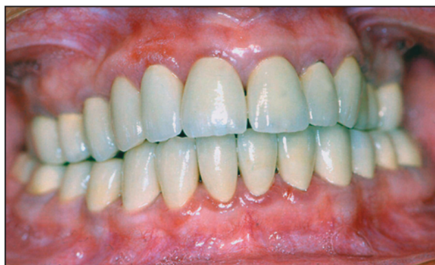
Figure 9. Clinical view of the patient with prosthetic crowns 1 year later.