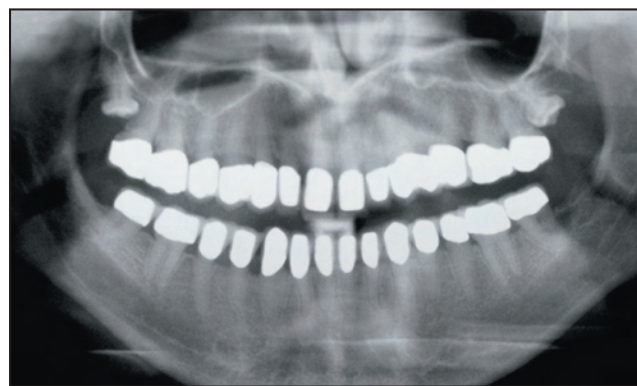
Figure 10. Panoramic radiograph 1 year later.