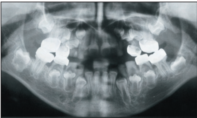
Figure 5. Disappear of the cyst and earlier eruption of permanent mandibular right second molar.