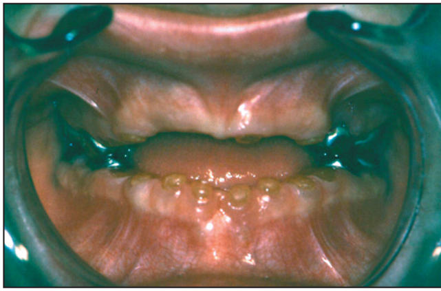
Figure 3. View of the new vertical dimension with stainless steel crowns on primary second molars and permanent first teeth.