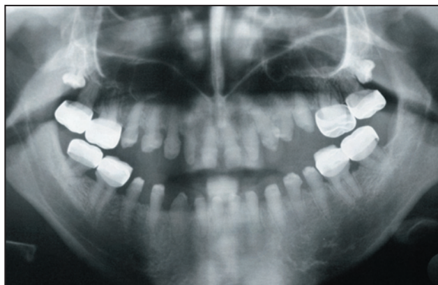
Figure 7. Panoramic radiograph at the end of the initial treatment.

Radiolucencies in the permanent teeth are also mentioned in the dental literature in the absence of any other