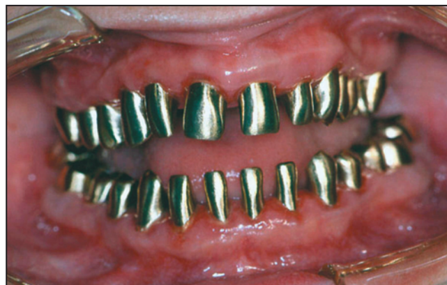
Figure 8. Metal framework adjusted in the mouth.