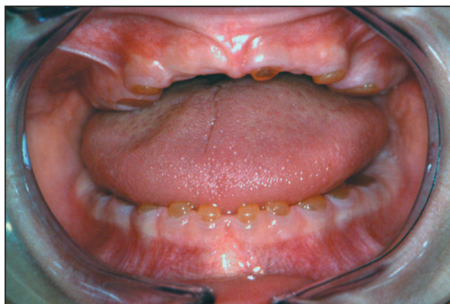
Figure 1. Clinical view of the dentinogenesis imperfecta patient.

The oral examination (Figure 1) showed excessive attrition of her primary teeth and loss of vertical dimension. Primary maxillary lateral and right central incisors and the primary maxillary left first molar were absent. No dental caries or abscesses were noted on the remaining teeth. First permanent molars had just erupted and were not yet worn.