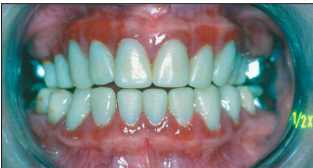
Figure 6. Appearance of the patient with completed temporary restorations after the initial treatment.

molar germ was diagnosed on a radiology control (Figure 4). Marsupialization of the cyst was undertaken, and the cyst was then packed with iodoform gauze (Ercemeche, Péters Surgical, Bobigny, France), which was renewed over a period of 2 months. Six months later, the cyst had disappeared entirely, a complete generation of the bone structures was seen (Figure 5), and the right second molar had erupted precociously. Shortly after the eruption of the lower and upper incisors, polycarbonate resin restorations (Ion, 3M ESPE) were fitted onto these teeth before attrition began.