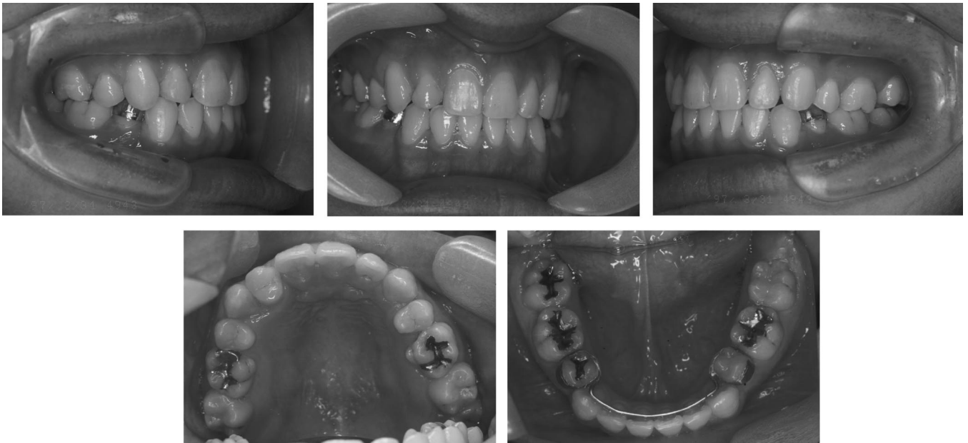
FIGURE 3. Posttreatment intraoral views.