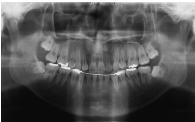
FIGURE 4. Posttreatment panoramic radiographs.

Frankfort horizontal plane ( 110.0^{\circ} to 107.2^{\circ} ), L1 to the mandibular plane ( 92.4^{\circ} to 88.0^{\circ} ), and FMIA ( 56.3^{\circ} to 63.3^{\circ} ), probably due to the extraction of the first premolars.