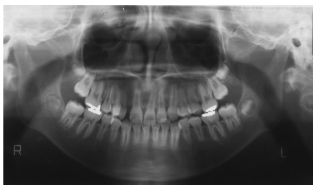
FIGURE 2. Pretreatment panoramic radiograph.

a maxillary removable retainer and a mandibular lingual fixed retainer were placed for retention.