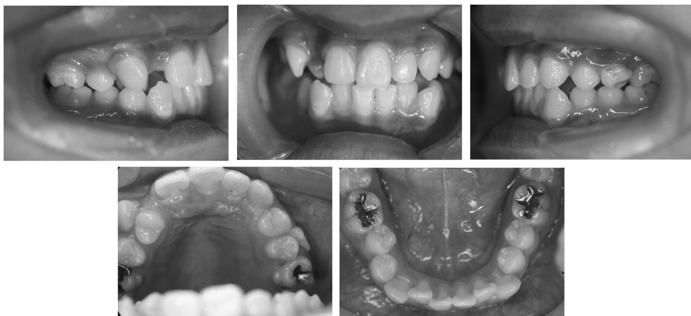
FIGURE 1. Pretreatment intraoral views.