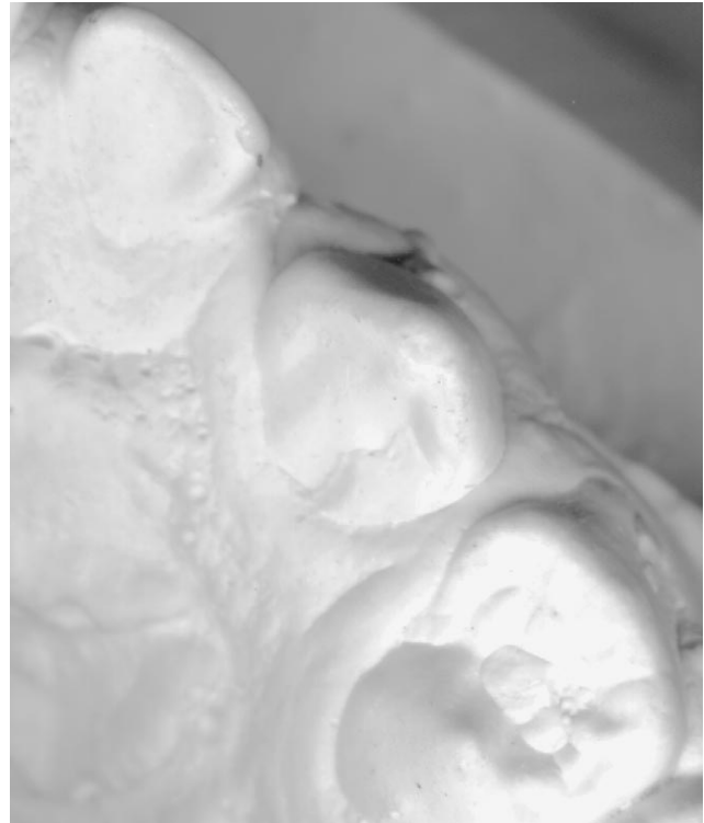
FIGURE 1. Score 0 = no obvious wear facets in enamel. Occlusal/incisal structure intact.

The recorded data for CB, NCB, and NCBC were organized as follows for statistical evaluation: