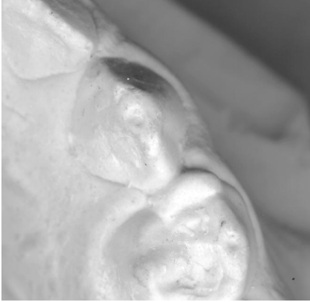
FIGURE 3. Score 2 = wear into dentin. Dentin exposed occlusally/incisally and/or occlusal/incisal structure changed in shape.